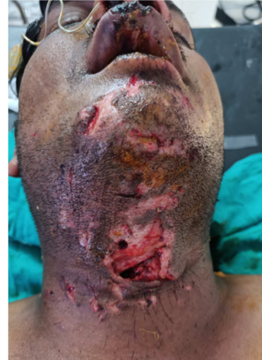
Figure 1. Cut throat injury revealing open laryngeal Fracture.

A 28-year-old male patient was admitted to the emergency room after a motorcycle accident with a truck. The Patient presented with a lacerated open neck wound with multiple small lacerated lesions of the skin over the neck and chin. The Patient was breathing comfortably from a lacerated open neck wound as if a laryngostomy had been done. (See Figure 1)