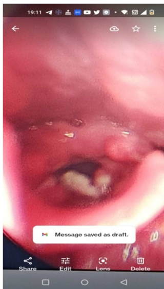
Figure 3. Post-op Direct Laryngoscopy revealed normal endolarynx except for a small mucosal tag in the supraglottis.

After completion, the Direct Laryngoscopy was done which is shown in Figure 3.