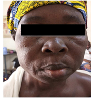
Figure 1. Right jugal swelling

resulted in rapid healing of otitis. The rest of the care was provided by the hematology department where she benefited from Biphosphonate and analgesic treatment. She was unable to honor the proposed protocol, Alexanian (Melphalan, Prednisone) in the absence of VTD (Velcade, Thalidomide, Dexamethasone). The death occurred six months later before she could receive chemotherapy.