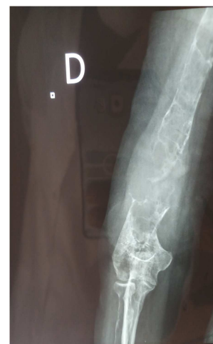
Figure 3. Right humeral conventional X-ray of the face displayed a pathological metaphyseal fracture with multiple lacunar lytic images diffuse with the punch and swelling of the facing soft parts.